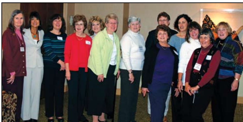
Class of 1968 at alumni breakfast:

At Homecoming in October 2008, 15 classmates came to the School of Nursing Alumni Breakfast to share wonderful stories of the past as well as to catch up on our current family happenings. We showed pictures of families, and brought our caps and freshman beanies. (It took awhile for the class to quiet down to get the breakfast program started—we always were a rowdy bunch.) Thanks to the School of Nursing faculty and students and the Nursing Alumni Association for such a warm welcome.