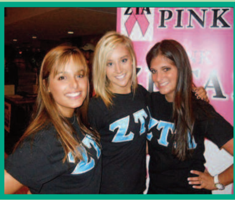
Zeta Tau Alpha girls join together in front of their "Think Pink" sign at Meet the Greeks.