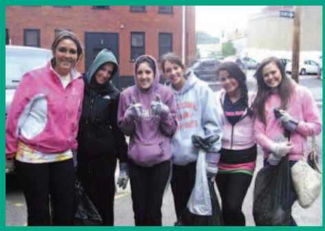
Sisters of Delta Zeta huddle together as they pick up trash in the South Side.