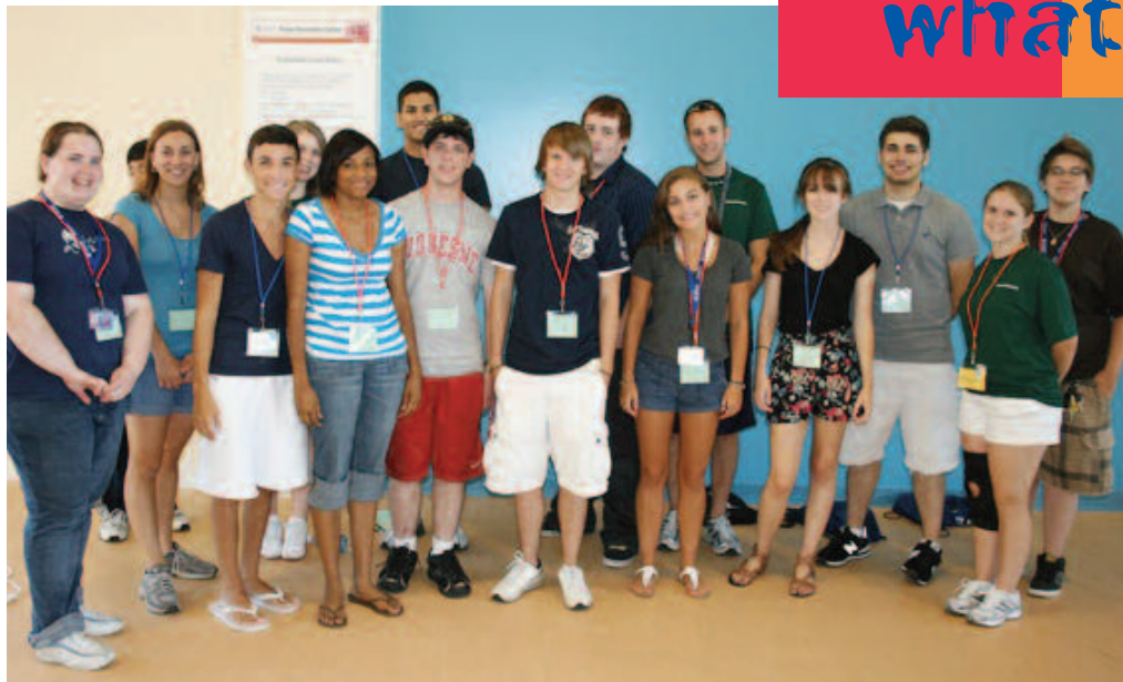
Commuter students enjoyed a preview of campus resources on Aug. 17.