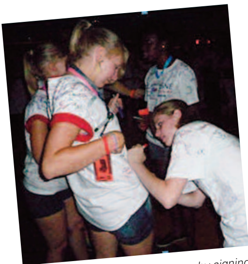
Students got to meet their peers by signing each others' shirts at the Graffiti Dance.