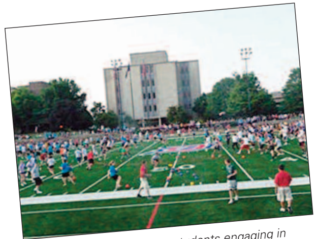
The Fall 2010 class of new students engaging in their attempt to break the record for the World's Largest Dodgeball Game.