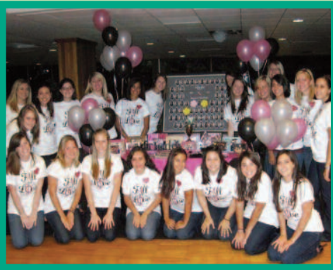
A group of Alpha Phi sisters pose together to show off their sisterhood during Meet the Greeks this year.