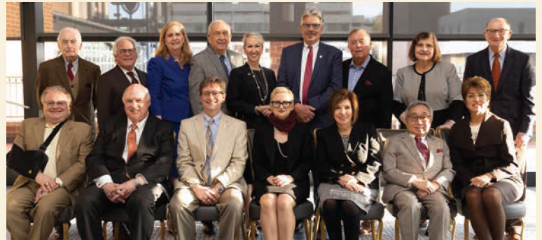
1911 Society Fellows pose at the event on April 8.

The 1911 Society Fellows program continues its pledge of excellence by supporting the mission of Duquesne Kline School of Law through cumulative financial support of more than $10,000. Fellows of the 1911 Society are committed to supporting key initiatives in the Duquesne Kline School of Law; these generous gifts transform the lives of our students and our School of Law.