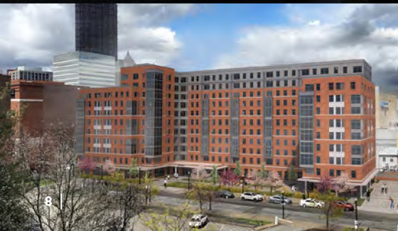
Our new 556-bed graduate student apartment building on Forbes Avenue opening in fall 2024

Whether you live on campus, commute or study entirely online, you'll enjoy what it means to be a part of the Duquesne family.