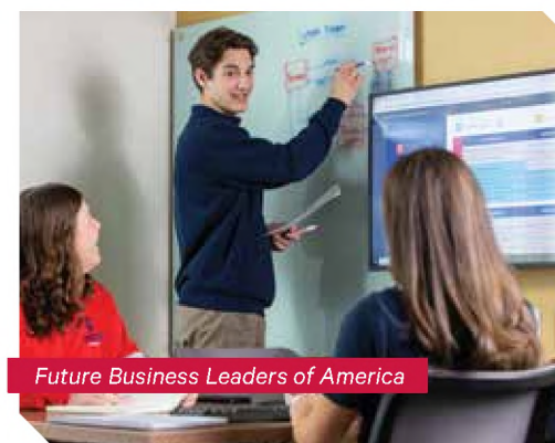
Future Business Leaders of America