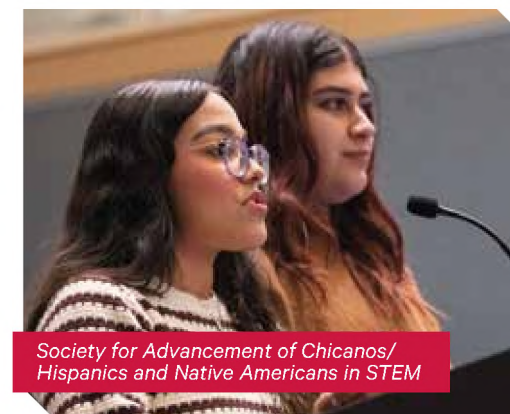
Society for Advancement of Chicanos/Hispanics and Native Americans in STEM