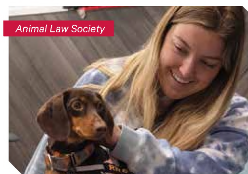
Animal Law Society