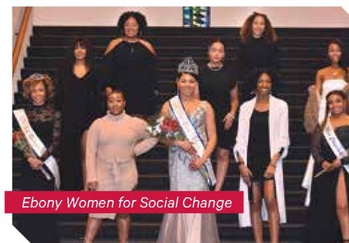
Ebony Women for Social Change