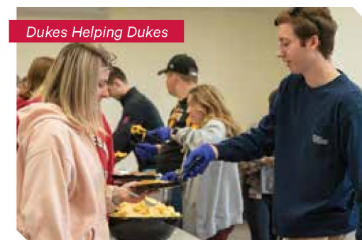
Dukes Helping Dukes