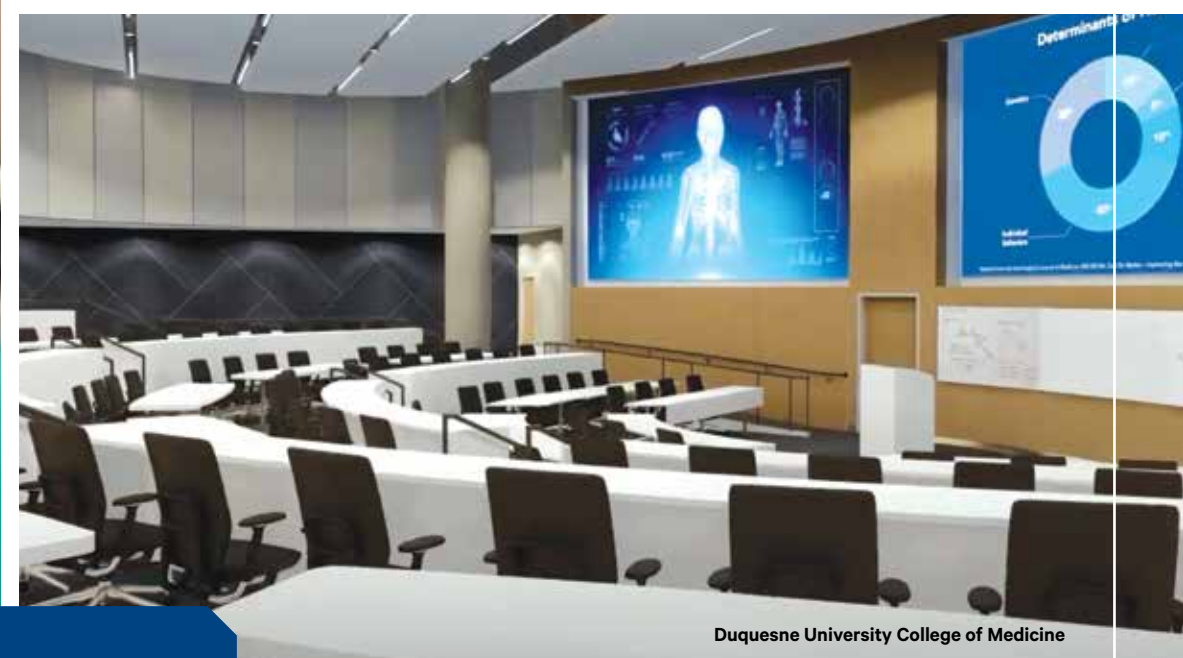
Duquesne University College of Medicine