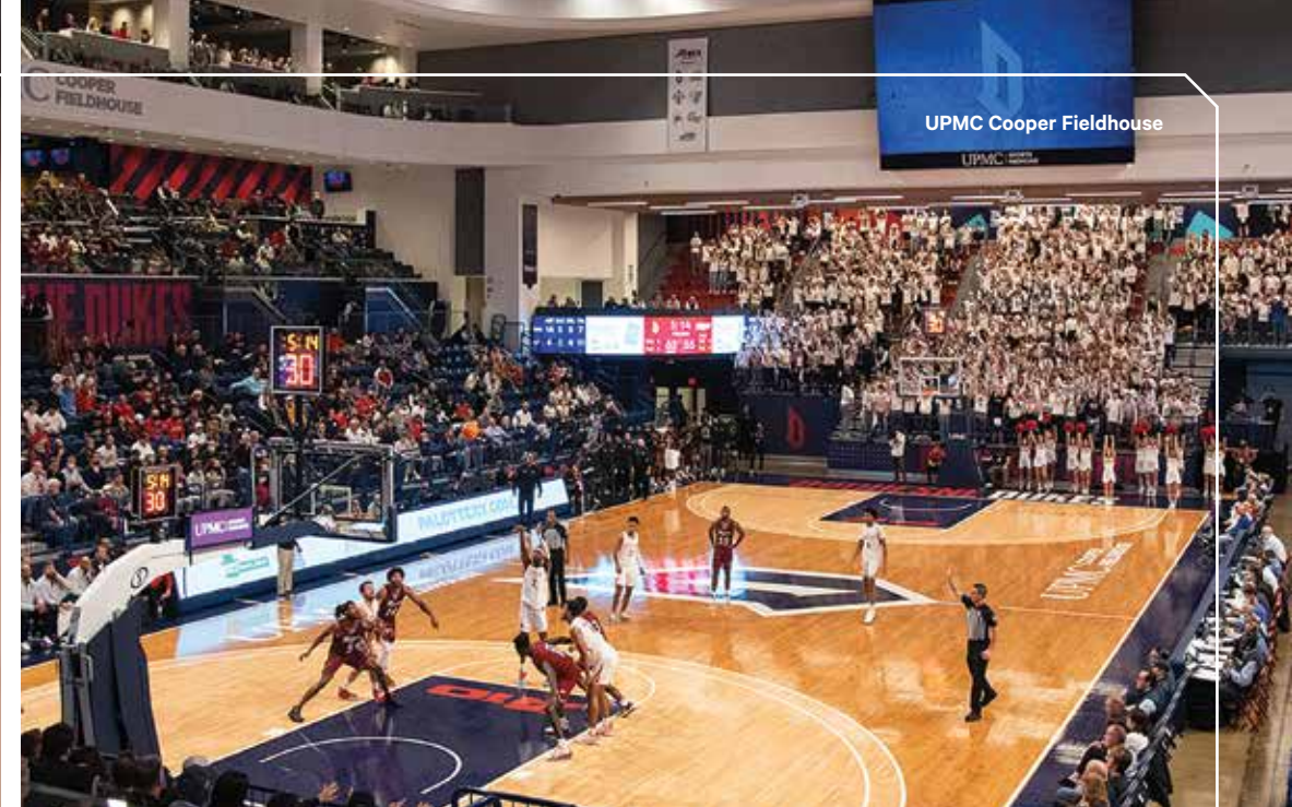
UPMC Cooper Fieldhouse

A CAMPUS COMMUNITY committed to innovation and growth.