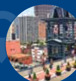
SELFIE STATION AND THE VIEW FROM SKLAR SKYWALK