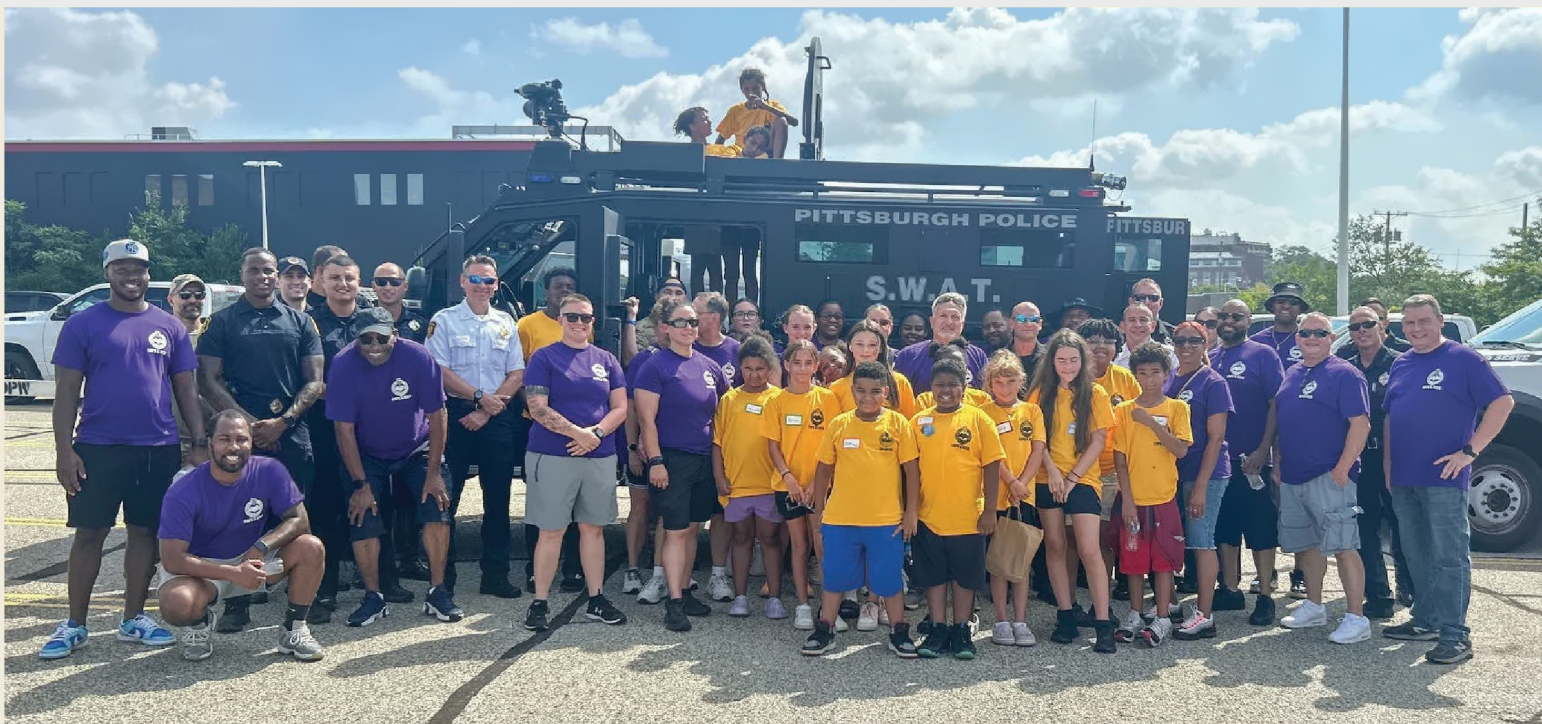
Cops and Kids