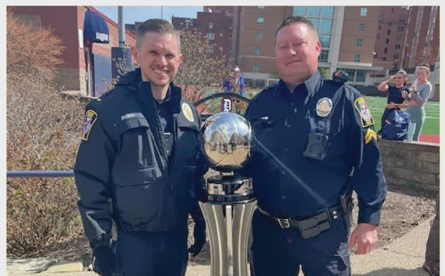
Basketball Championship Trophy

The Department of Public Safety maintains a log of all criminal incidents reported to the department. The daily crime log includes the date and time the report was received, the date and time the incident occurred, the nature of the offense, the location of the offense and the disposition if available. The daily crime log is available for public inspection at the Department of Public Safety.