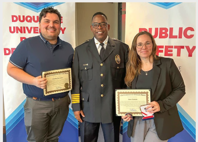
Residence Life receiving Chief's Community Outreach Award