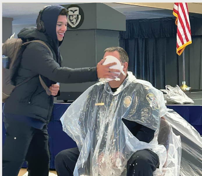
Pie the Police Event