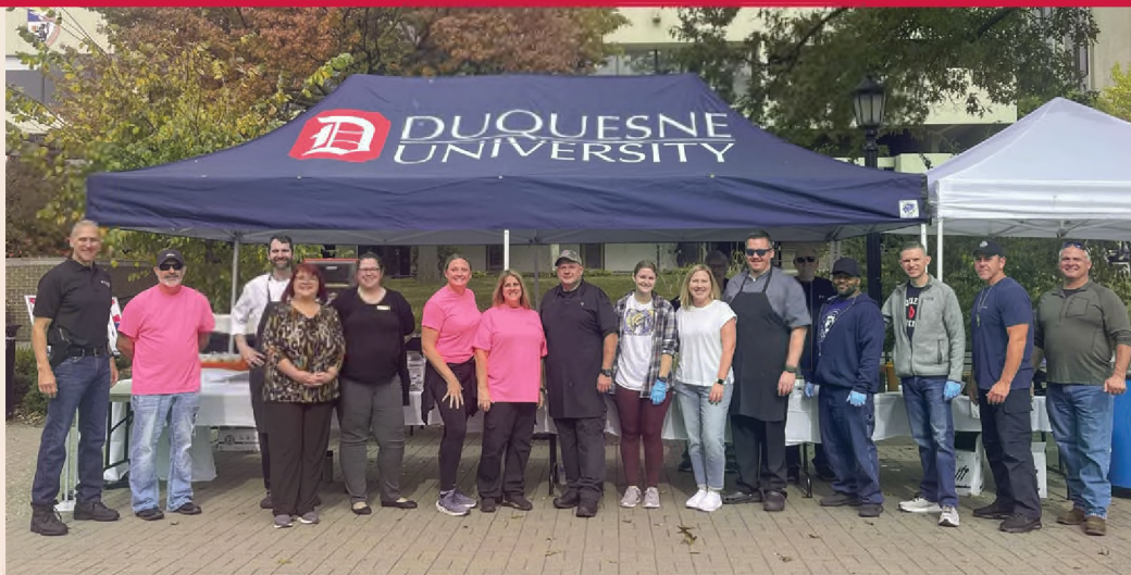
Cops and Chefs 2023

The following are free* program topics offered through Public Safety open to both students and employees: