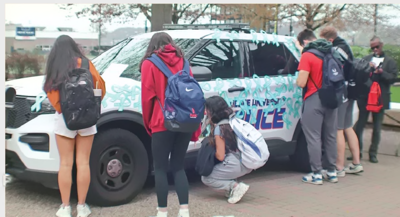
Cover the Cruiser