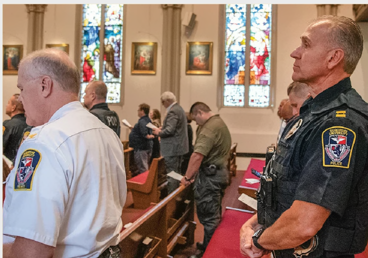
Public Safety Blessing

A. The confidentiality of your report is maintained to the extent possible. Your report is not shared publicly except as permitted or required by applicable law. Your report may be shared with University Officials with a need to know, including to provide you with assistance and support. After reviewing the report, Duquesne Public Safety may determine there is a serious or on-going threat to the community and may determine that it is necessary and required to issue a campus Crime Alert. These alerts will not include any identifying information about the victim. An anonymous record of any on-campus assault among Duquesne's crime statistics will be filed in order to give an accurate representation of crime on campus and to help prevent further crimes of this nature.