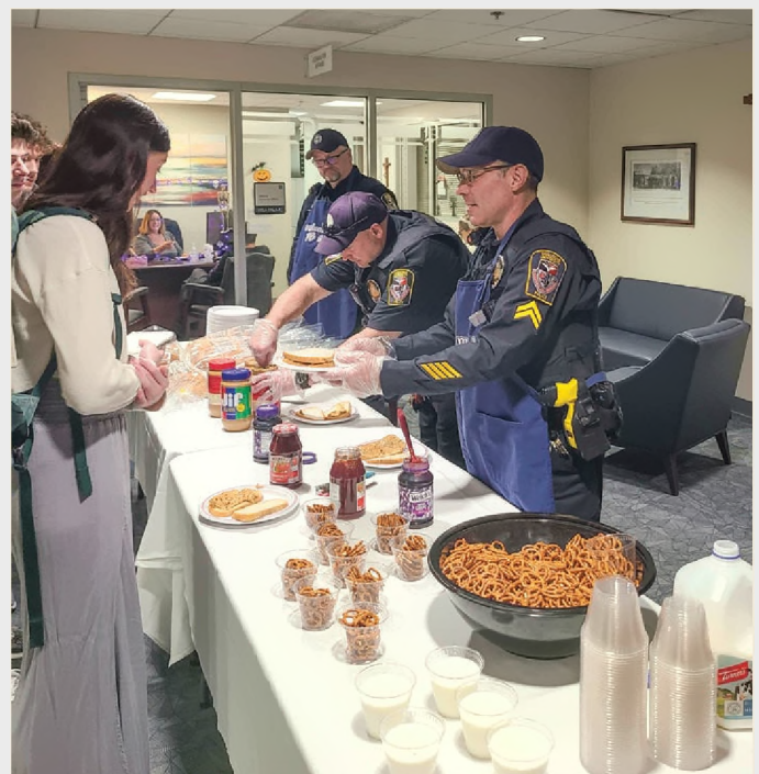
PB and J Event

If the victim of sexual or relationship violence elects to pursue criminal or disciplinary action, the investigation (and disciplinary procedure) shall be conducted in a manner to protect the confidentiality of personally identifying information as defined by the VAWA of 1994 Section 40002(a).