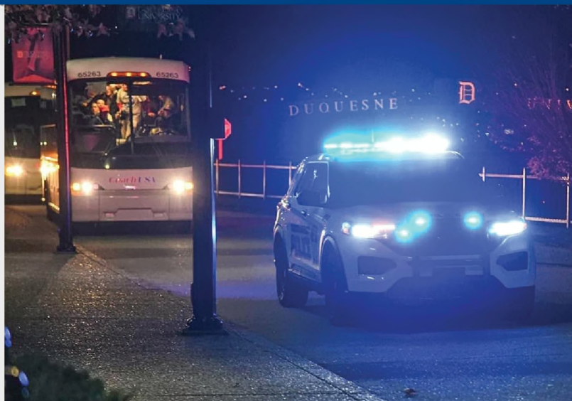
Leading Football Team

Failure to comply with this policy and its notice requirement may jeopardize continued research funding to the University and will be considered grounds for dismissal.