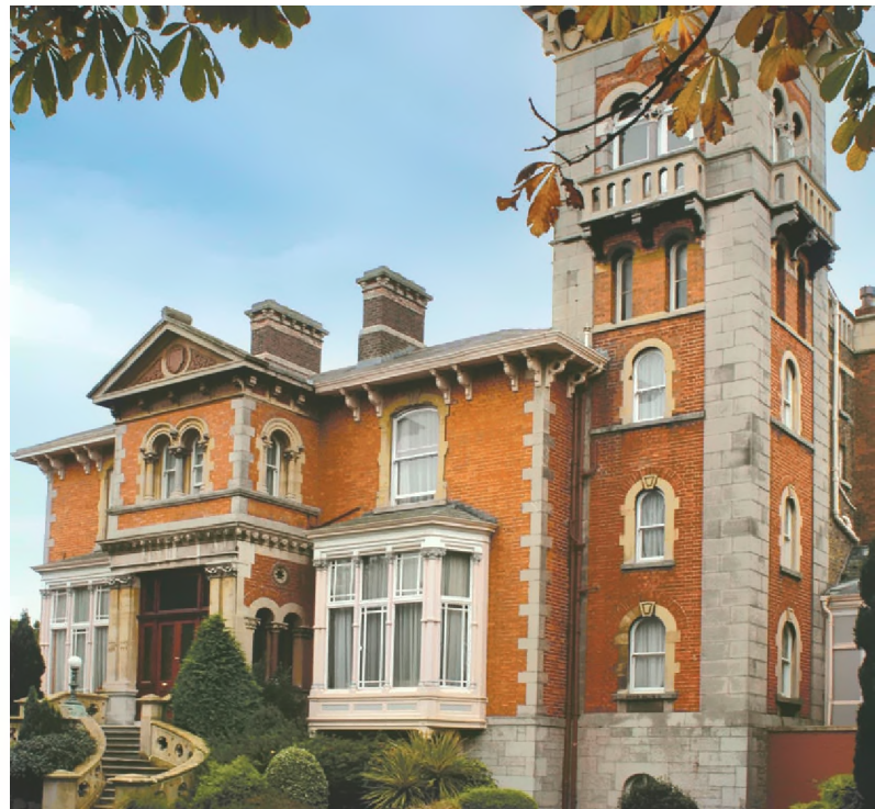
St. Michael's House

Duquesne partners with the International Learning Academy (ILA) in Dublin, which is responsible for maintaining the Dublin daily crime log and fire log. The Clery crime statistics from the Dublin Study Center are obtained from criminal incidents reported to the International Learning Academy and forwarded to Duquesne's Department of Public Safety for inclusion in the Annual Security Report. All emergencies, including medical, crimes and fires are to be reported to the International Learning Academy who shall immediately assist the student with contacting the appropriate Dublin emergency officials. Ireland has an emergency three digit telephone system like the American '911.' The three digit emergency telephone number in Dublin, Ireland is 999 for Police, Fire, Ambulance and General Emergency.