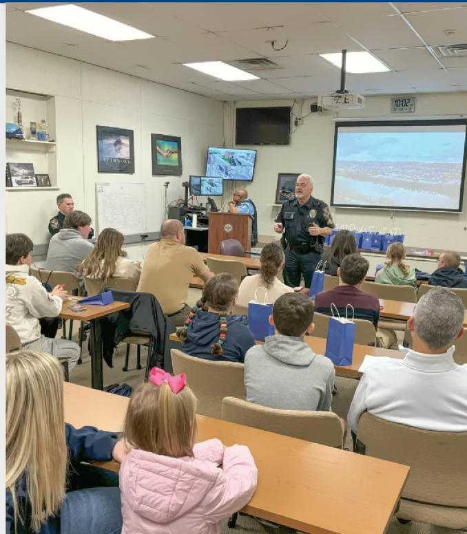
Take your Child to Work Day