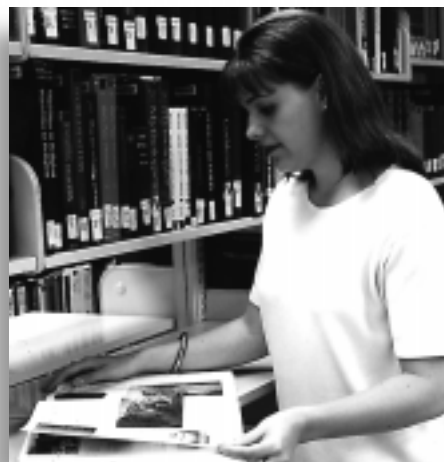
A student utilizes the reference materials on the 4th floor.