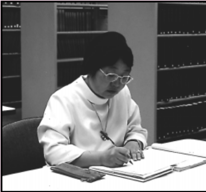
A student studies on the 4th floor.