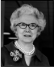
Eleanor McCann Collection of Modern American Literature