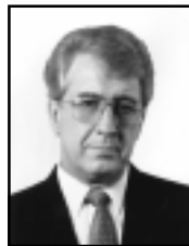
Dr. John E. Murray Jr., Collection of Philosophy

These funds reflect their interests and scholarly pursuits. A brief description of each fund follows: