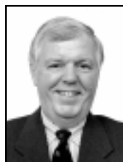
Dr. Michael P. Weber Collection of Urban Affairs