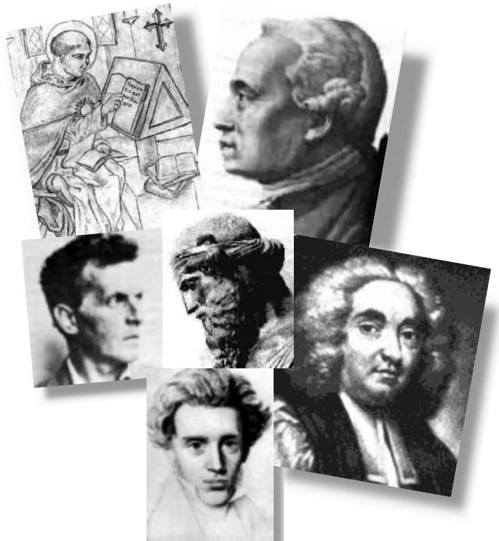
From top, left to right: St. Thomas Aquinas, Immanuel Kant, Ludwig Wittgenstein, Plato, George Berkeley, Soren Kierkegaard