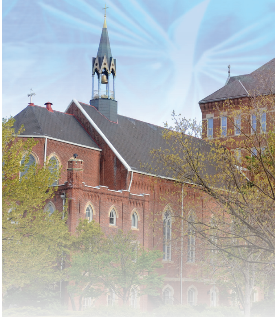
Duquesne University Chapel of the Holy Spirit

“SPIRITUS EST QUI VIVIFICAT.” It is the Spirit Who gives Life.