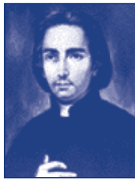
Claude Poullart des Places