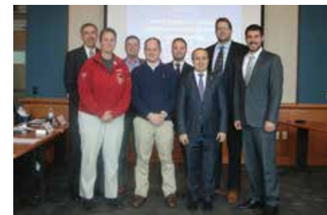
Inaugural meeting of the RSHS Advisory Council on November 8, 2018 to discuss the School's Strategic Plan

The Advisory Council is key to the School and provides expertise and advice in a variety of areas in the healthcare environment, guiding the School towards its stated mission and philosophy and assisting in meeting the goals within the RSHS 2019 – 2023 Strategic Plan. The Advisory Council's diverse professional skills, awareness and concern to improve the healthcare needs of the community place RSHS in a unique position for current and future initiatives.